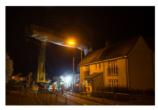
Lifting out the old bridge

Network Rail's "orange army" successfully replaced the footbridge in Corsham in the early hours of 22 March. To minimise disruption for residents and any risk of the work overrunning, we decided to build the new bridge off site. We then transported it by road and, using a 500 tonne crane, lifted it up 10 metres, over a block of flats into position. This method of working ensured a reduced impact on the local community, as there was no need for a longer road closure, usually required for on site bridge reconstructions. Work is now taking place to divert utility services and tie in the existing road so the new footbridge can open in June. If you would like to see our team in action, visit our website to watch the time lapse film: www.networkrail.co.uk/greatwestern-route-modernisation/wiltshire/